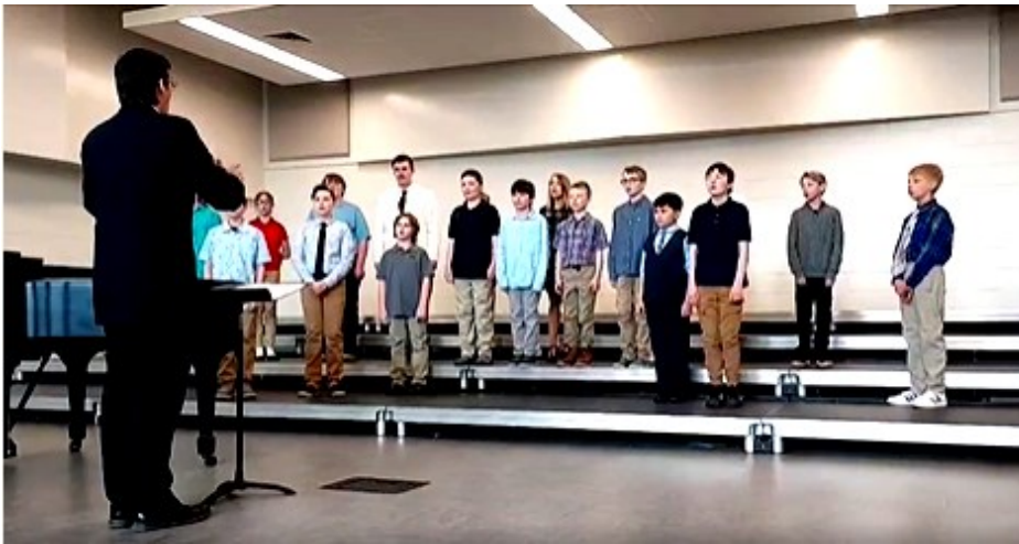
4th—7th Grade Choir Participated in the Lutheran Middle School Music Festival on May 5, 2022