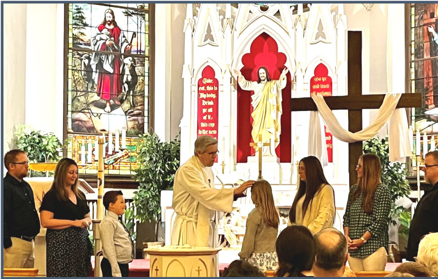
Two St. John students were baptized on May 3 during chapel.