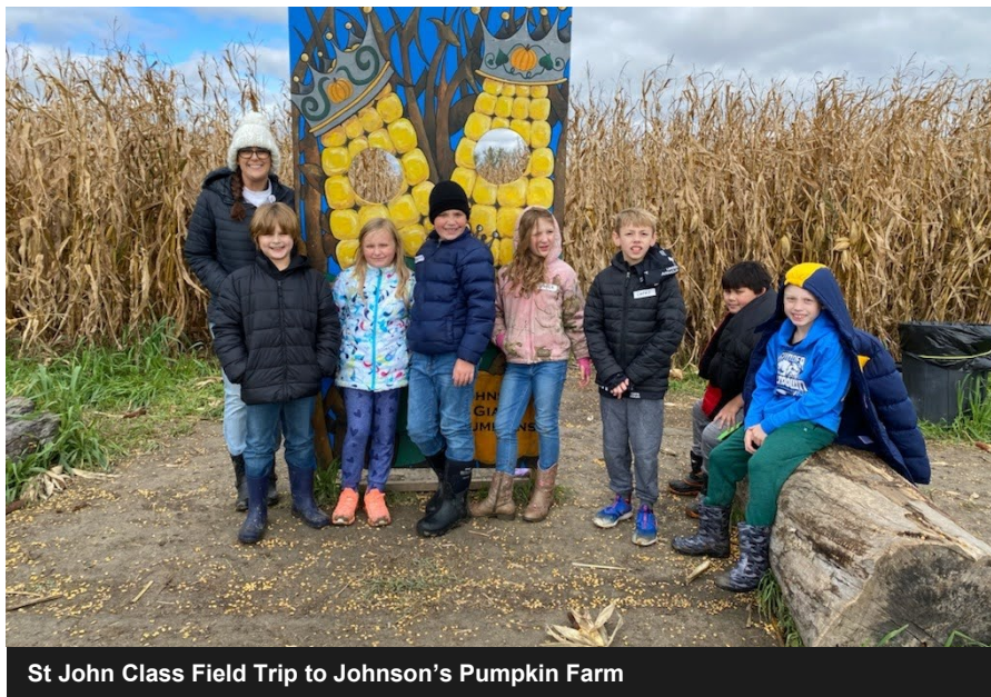
St John Class Field Trip to Johnson's Pumpkin Farm