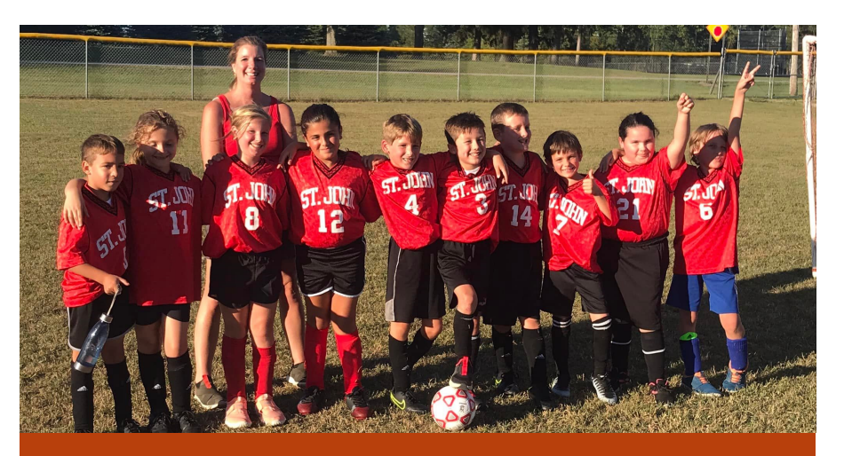
St John 1– 4 Soccer Team