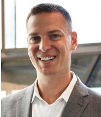
CHIEF OPERATING OFFICER