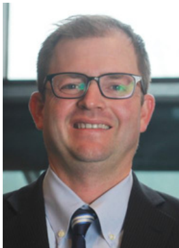
VICE PRESIDENT, FINANCIAL SERVICES