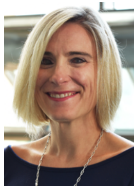
CHIEF OF STAFF