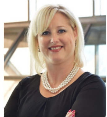
VICE PRESIDENT, ADMINISTRATION