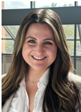
VICE PRESIDENT, COMMUNICATIONS