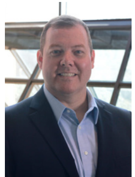
DIRECTOR OF RESEARCH & PROGRAM DEVELOPMENT