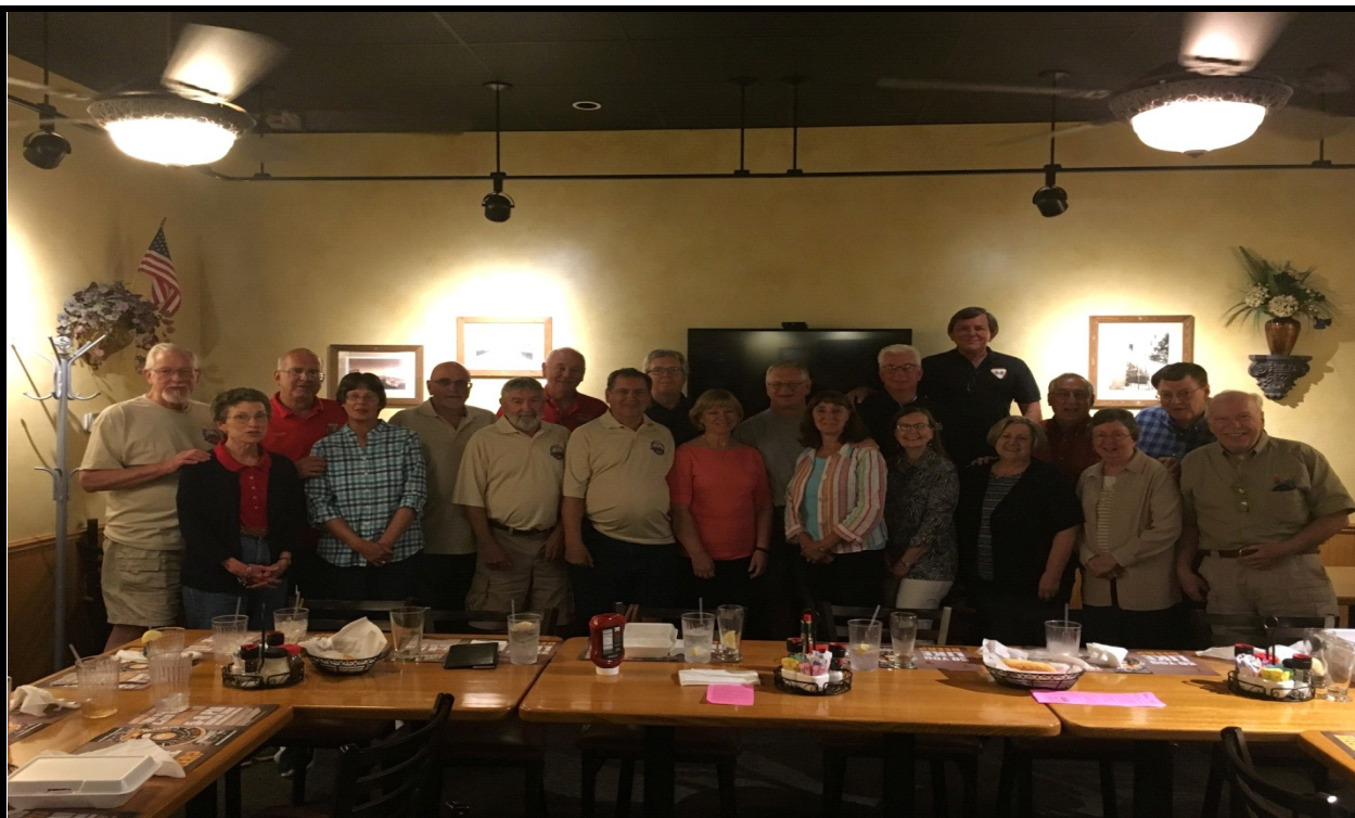
Friday Night dinner