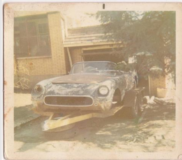
Picture 3- Also a work in progress. Taken 1973

My father used to walk around Carlisle wearing a sandwich board. The front of the board saying "53-55 Parts Needed" and the back saying "53-55 Parts Have".