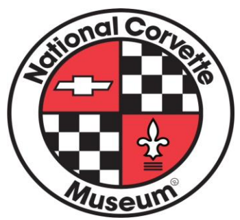
News from the Museum

That starting in 2005 all Corvettes had exposed headlights. Not seen in Corvettes since 1962.