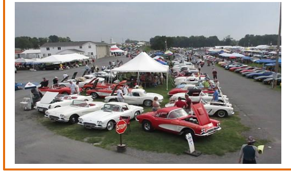
Solid Axle Club Convention at Carlisle 2021

Roger also received the 5 Star Road Tour Pin for driving to the National this year and "The Breakdown Award" for having some car trouble on the way!