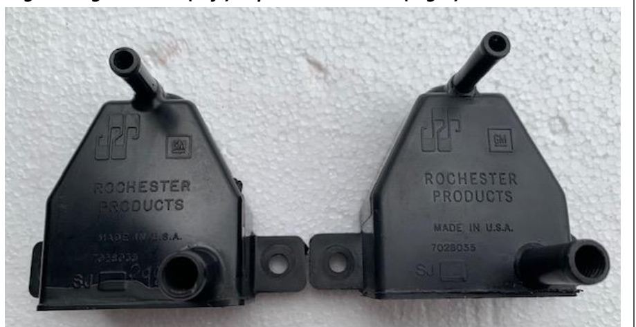
Fig. 1- Original valve (Left) Reproduction valve (Right)

Take a close look at the valves in the photos on this page. In Fig. 1 The side by side view you'll notice the difference in the graphics between the two. Fig. 2 & 3 illustrate the extreme amount of added sealant along the bottom seams. (Doesn't that tell you something?).