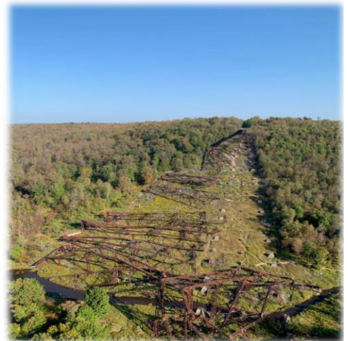
Photo on the right shows the fallen steel pillars after the tornado hit the viaduct in 2003.