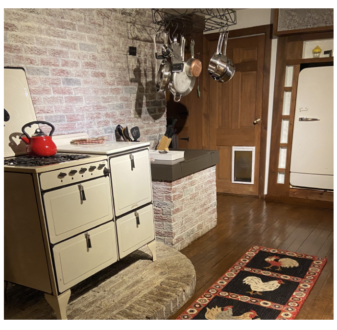
1868 Farm House - Rustic farm house & horse barn on 80 acres. Horse and dog lovers paradise!