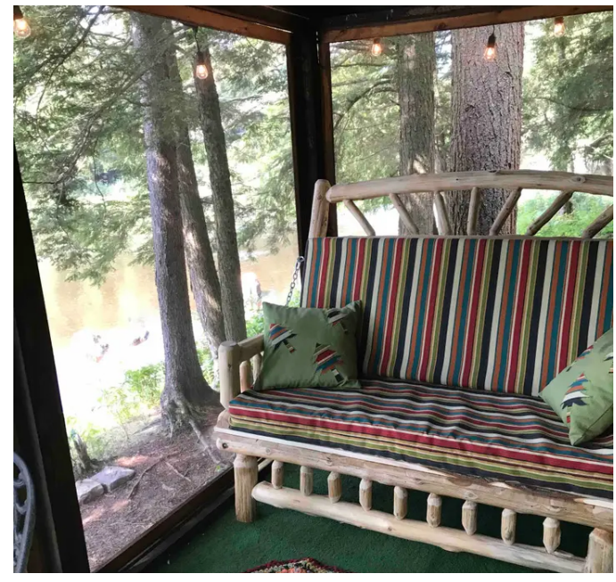
ADK River Overlook Cabin - Overlooking the river. Spectacular views & soundscape.