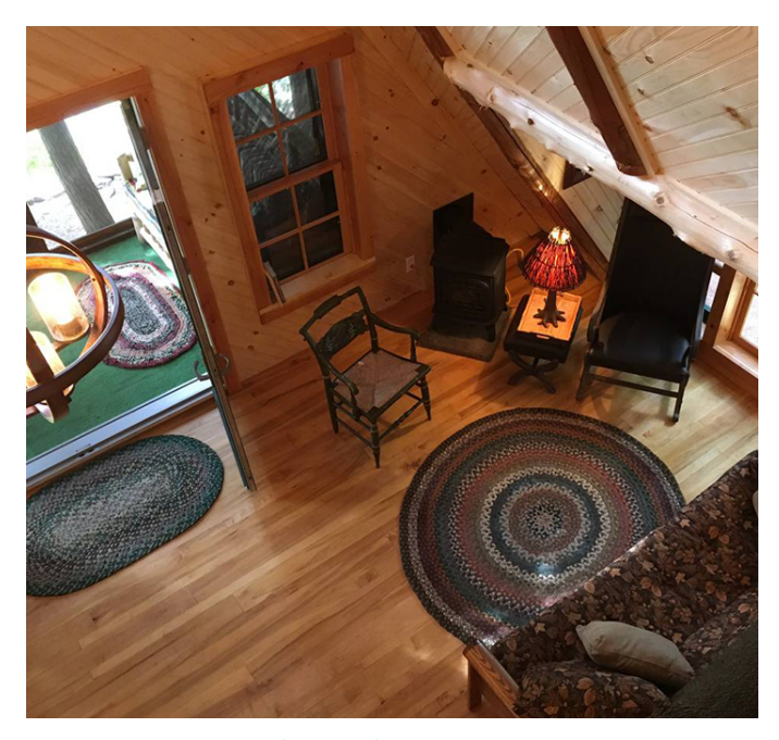
ADK Riverside Cabin A Frame Right on the water!