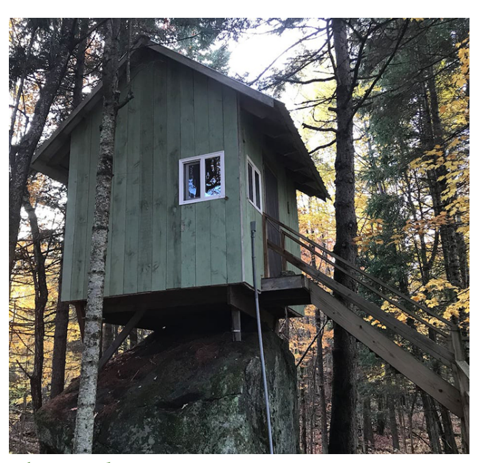
The Rock House - Up in the trees! Private tub and firepit!