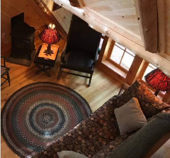
ADK Riverside Cabin A Frame Right on the water!