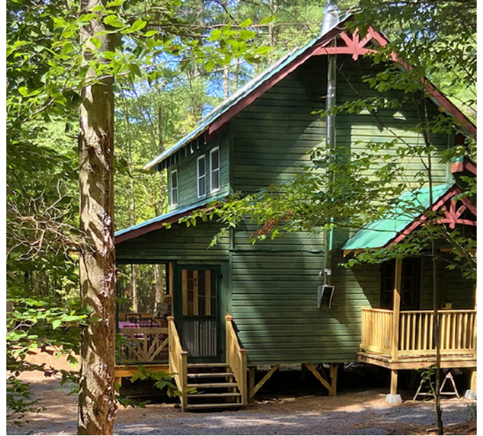
ADK River Overlook Cabin Overlooking the river. Spectacular views & soundscape.