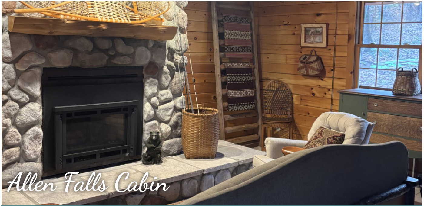
Allen Falls Cabin