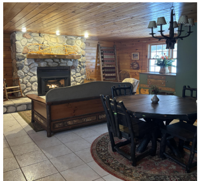
Allen Falls Cabin In Parishville