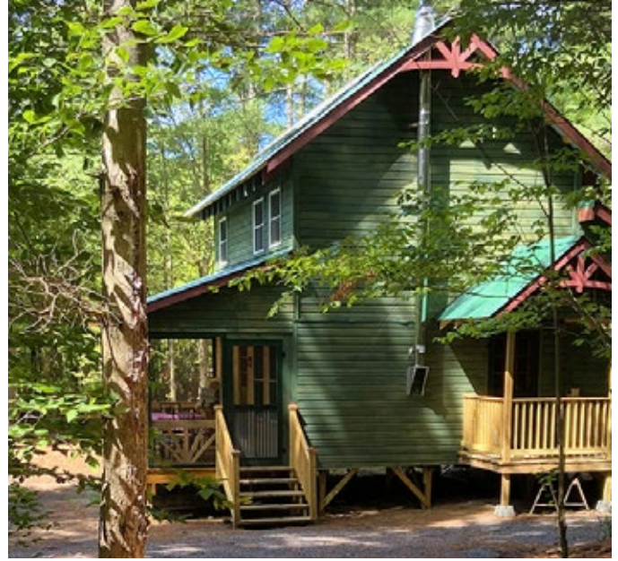
ADK River Overlook Cabin Overlooking the river. Spectacular views & soundscape.