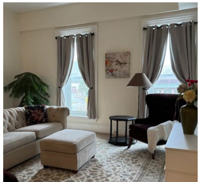
21 Main St. in Canton Upstairs in Nature's Storehouse historical building.