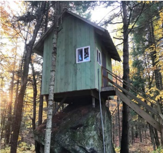
The Rock House Up in the trees! Private tub and firepit!