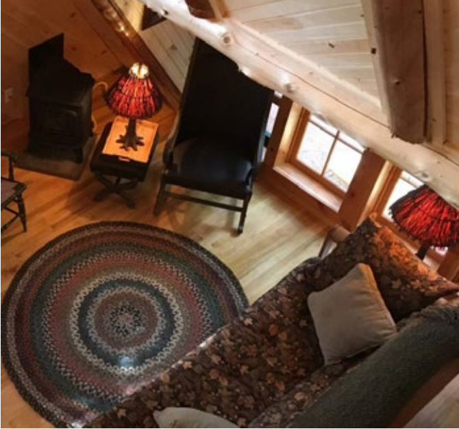
ADK Riverside Cabin A Frame Right on the water!

Rental Properties at 1150 Sylvan Falls Road Hosted by Sandy & Lou Maine