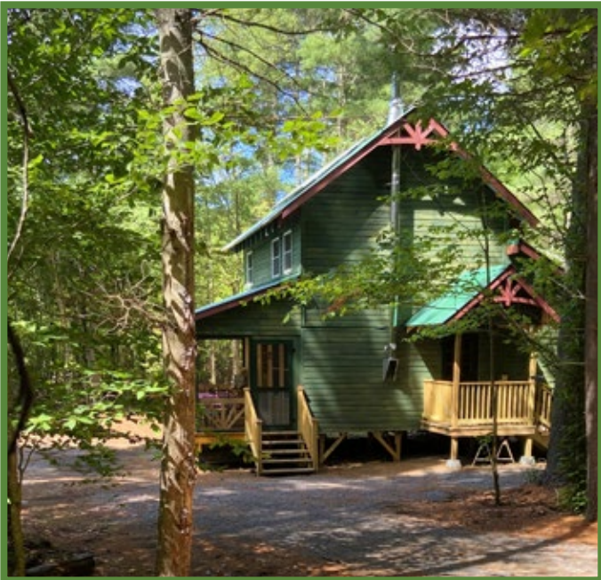
ADK River Overlook Cabin Overlooking the river. Spectacular views & soundscape.