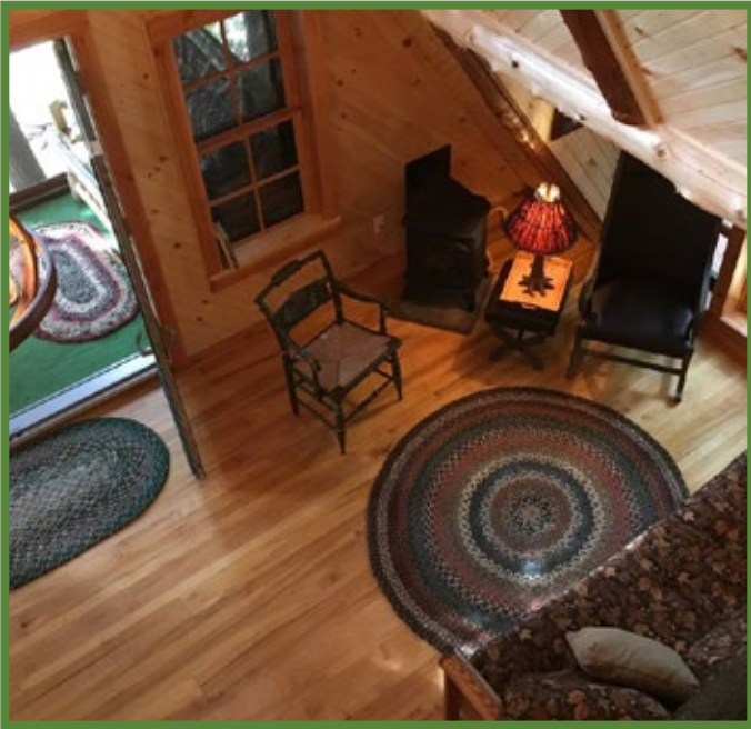
ADK Riverside Cabin A Frame Right on the water!