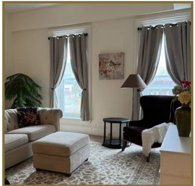
21 Main St. in Canton Upstairs in Nature's Storehouse historical building.