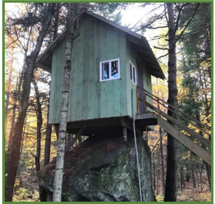
The Rock House Up in the trees! Private tub and firepit!