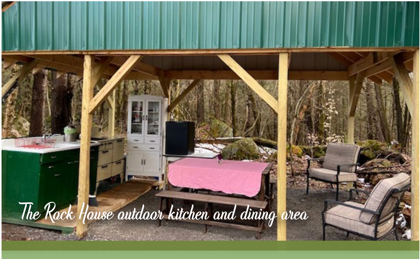
The Rock House outdoor kitchen and dining area