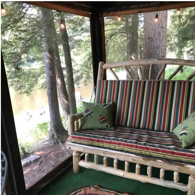
ADK River Overlook Cabin - Overlooking the river. Spectacular views & soundscape.