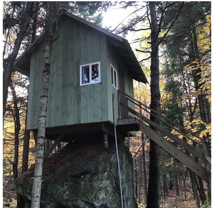
The Rock House - Up in the trees! Private tub and firepit!