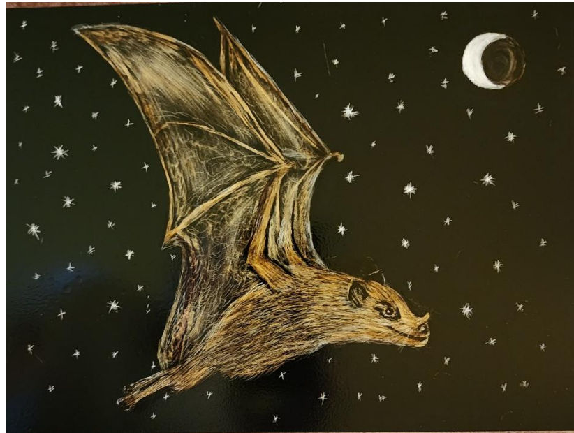
“A Bat in the Sky”, Scratchboard by BetteLou Tobin