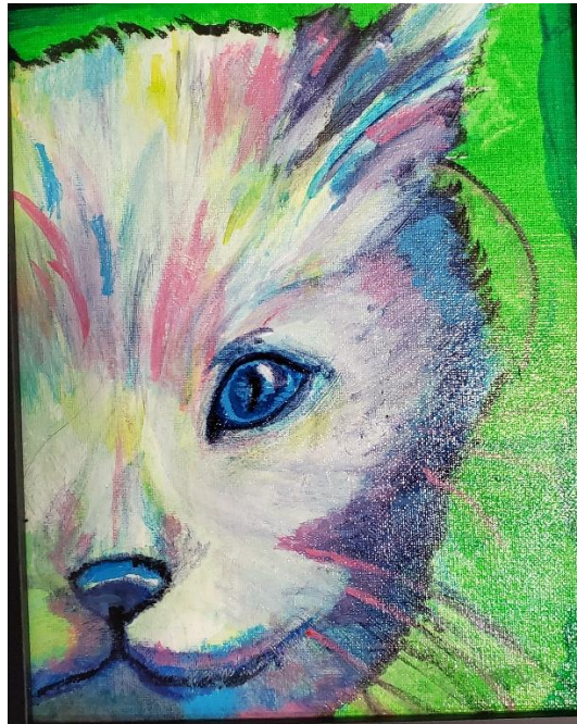
“Mischievous” Acrylic by KC