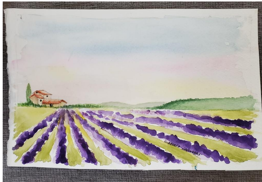
“Lavender Fields” Watercolor by Cindy Chambers