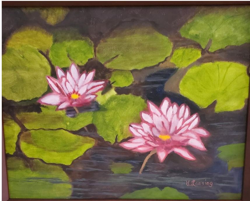
“Waterlilies” Oil by Victoria Lansing