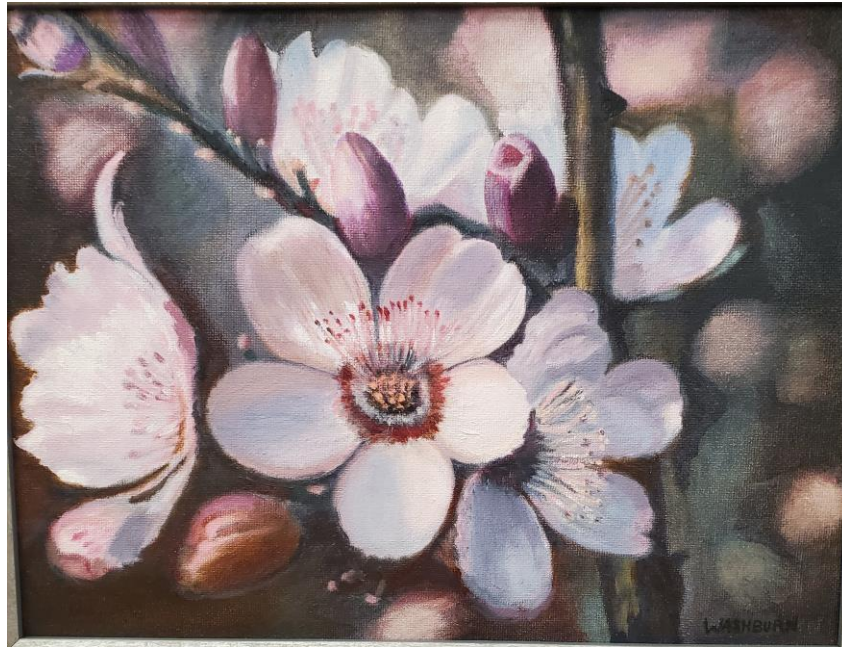
“Springtime Blooms” Oil By Pat Washburn