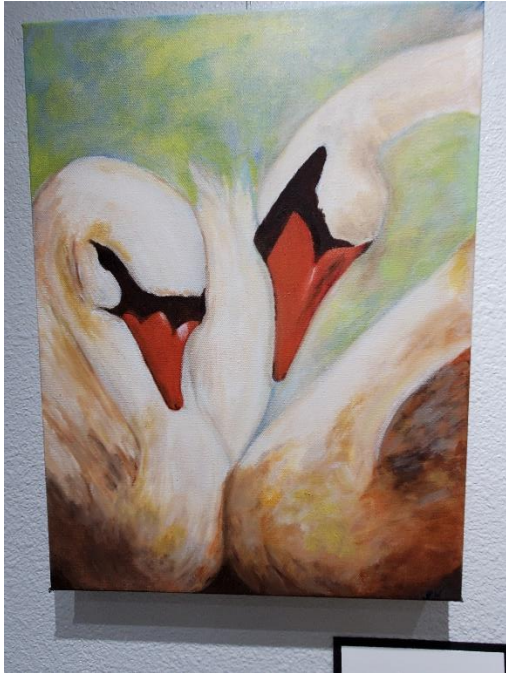
“Swan Song” Oil by Pat Washburn