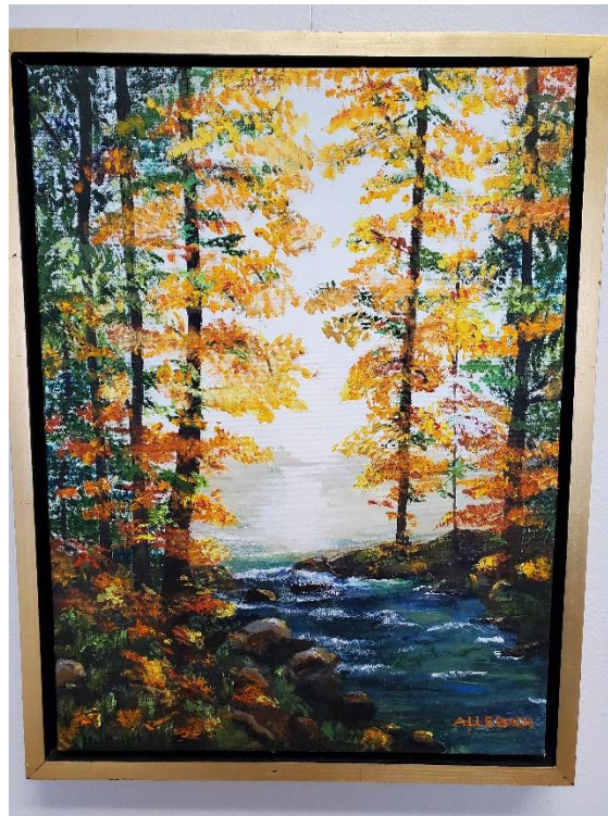
“Echo Lake” Acrylic by Jo Allebach