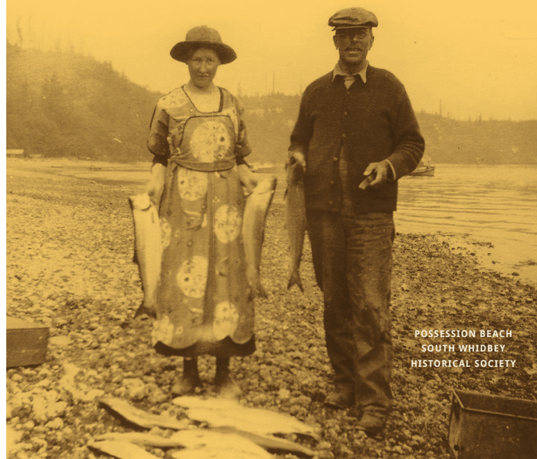
POSSESSION BEACH SOUTH WHIDBEY HISTORICAL SOCIETY

Clinton is a vibrant and historical community, and has been around since the early 1800's. To learn about the history of Clinton and other South Whidbey communities, please visit the South Whidbey Historical Museum in Langley, or go to SouthWhidbeyHistory.com