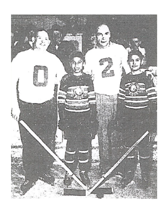
Illustration 2: Bucko McDonald & Lionel Conacher (former NHL stars and later Members of Parliament) with two members of the Black Hawks hockey team.<sup>16</sup>

Newspaper passages, such as "Dignitaries, photographers and presentations marked last night's arrival of the all-Indian Sioux Lookout Black Hawks at the Auditorium," broadcast a number of messages to the public, including how important and unique the tour was in Canadian political circles. It seemed like nothing escaped the public eye. The high significance associated with this hockey tour in the newspaper reporting and in the participation of various prominent community figures is important to note because it provided the readers (who were predominately non-Aboriginal) with a framework for how to view the story of the Black Hawks and, thus, capturing their attention.