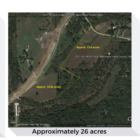
For More Information