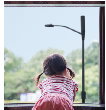
Children are especially at risk from wireless radiation