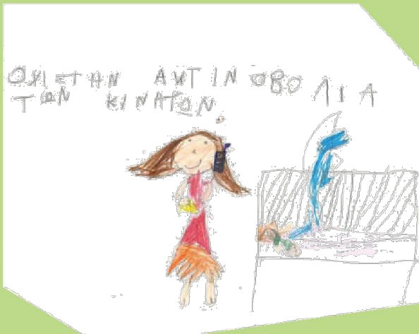
Myrsini Manitaki Loizou, 5,5 years old