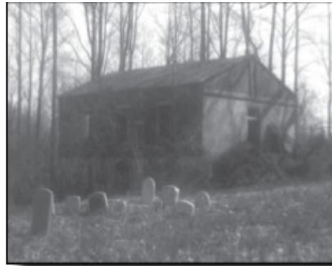
A photo of the Mount Olivet church/school from the early 1970s.

A cleanup of the church cemetery was undertaken in 2004. The picture below is from the August 2009 Township Newsletter.