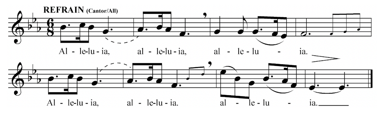
*Gospel: Matthew 11:2-11