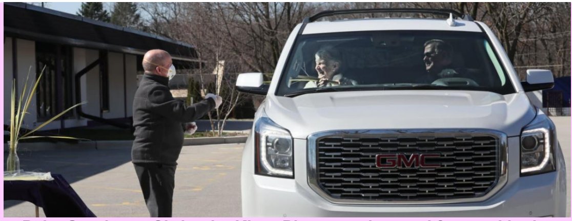
Palm Sunday at Christ the King

of the church and ask you to consider giving electronically through our website or by mailing in your offering during this time.