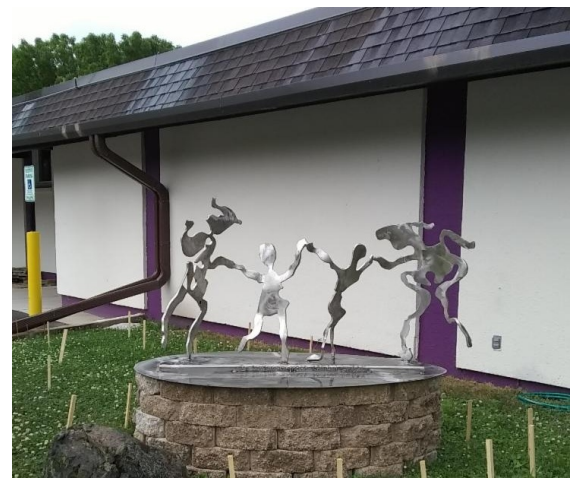
Click Here To Find Out More