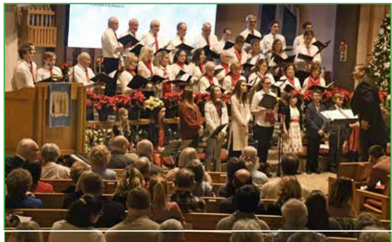
Lessons and Carol Christmas Concert December 22, 2019