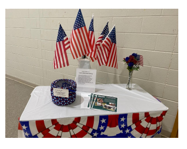
Veterans Day Camp Hometown Heroes