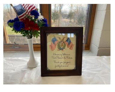
Honoring our Veterans