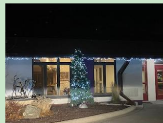
CTK in dressed for Christmas