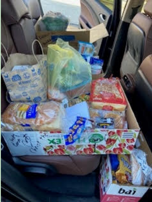
Car loads for Family Promise