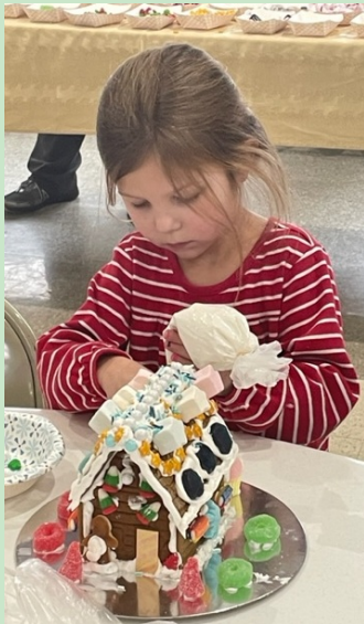
Gingerbread house decorating