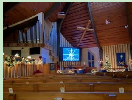
In the peaceful and quiet moments of the longest night of the year, those who felt sadness came to find hope at CTK sanctuary

Family Promise "Host" Week Nov. 27th - Dec. 3rd Response!