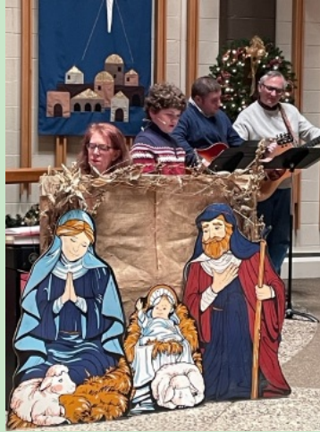
Special music filled the air