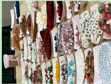
Lots of candy was offered for each person to be creative in their decorating