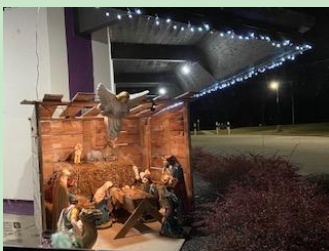
Our Nativity on the corner that welcomes everyone.