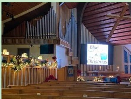
Blue Christmas Meditation Hour