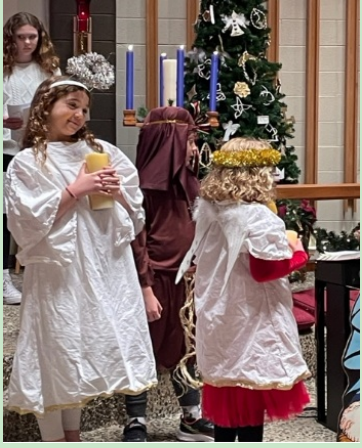
Angels and a sheperd tell the story