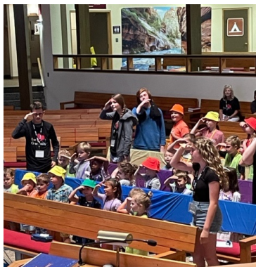
On the lookout!