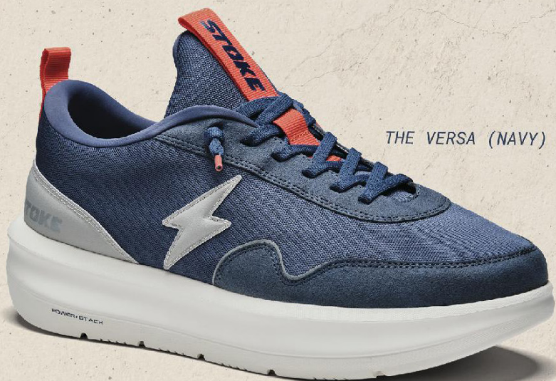
THE VERSA (NAVY)

REAL ROOM, REAL CUSHIONING, REAL COMFORT.