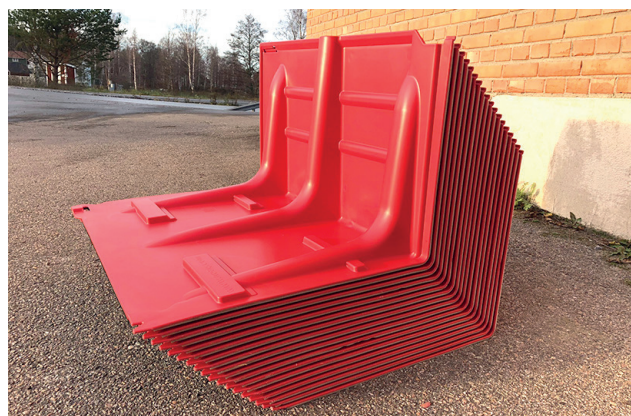
26 boxes (straight or corner ones) fit on standard pallets 800 x 1200 mm. Gables are delivered in cardboard boxes.