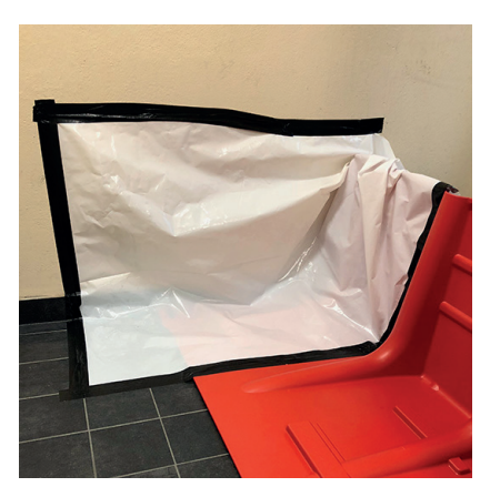
Using a piece of liner for sealing