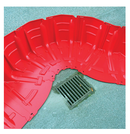
Drag the boxwall behind gullies