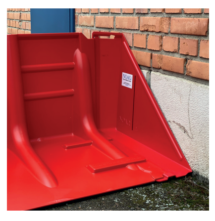
Connection using a gable..