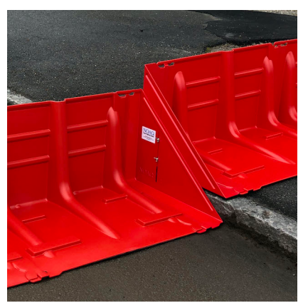
Gables to cope with kerb stones