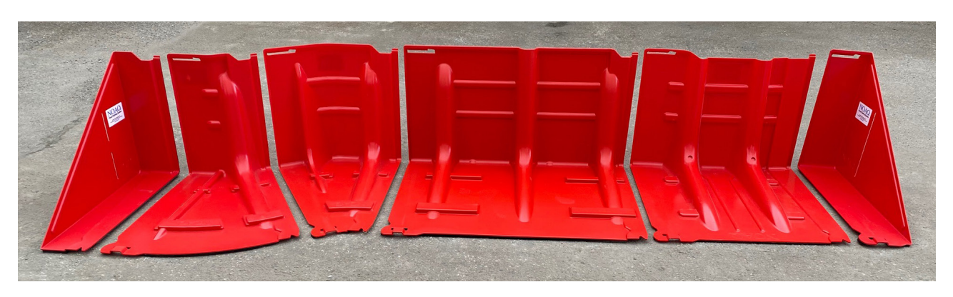
BW52-GR, BW50-OC, BW50-IC, BW52, BW50, BW52-GL