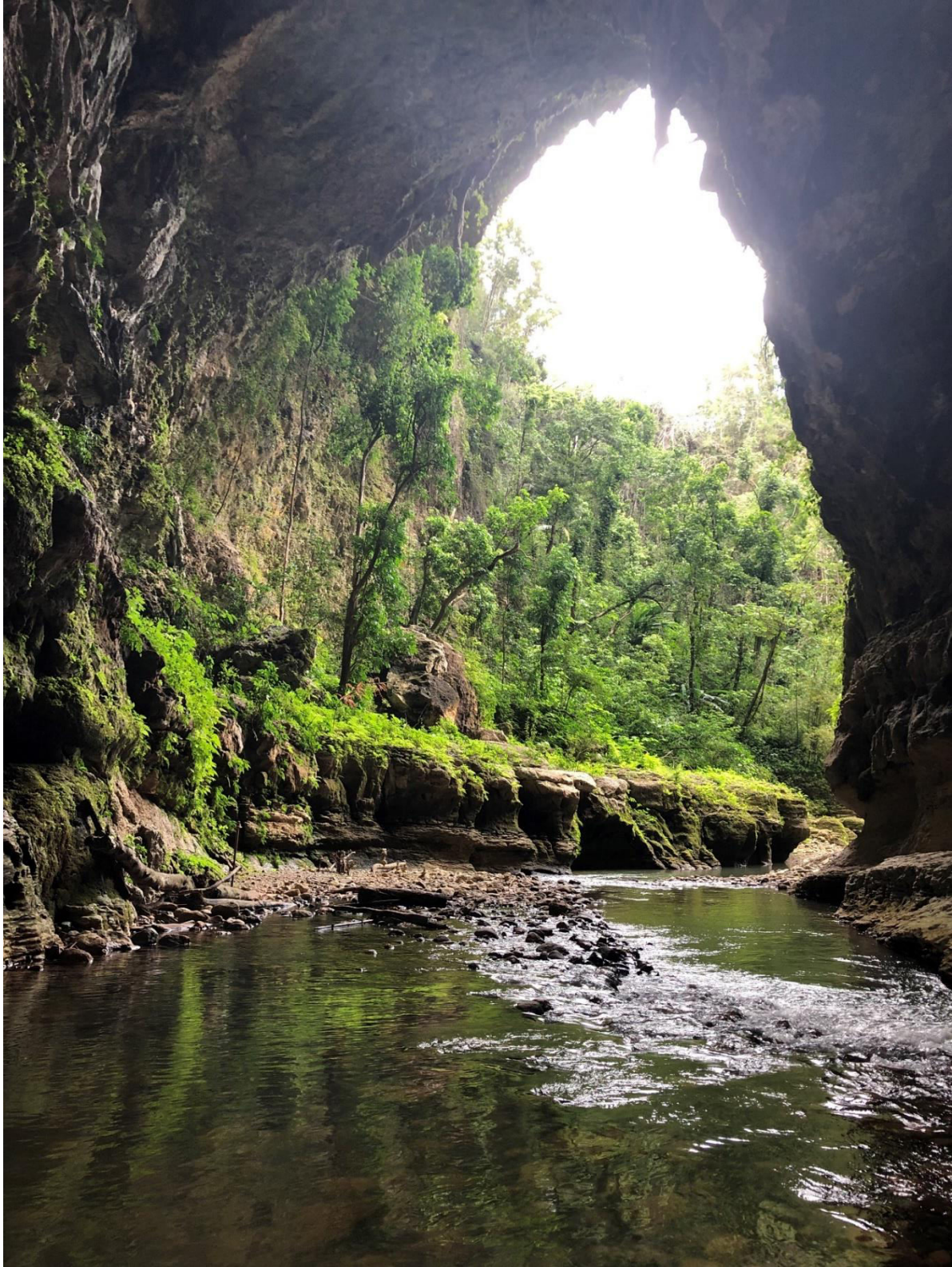
Monasterio Místico de San Juan el Bautista del Saneamiento Indígena y Monástica