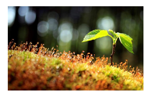
"Let us hope it will always be like this, each of us going on in our explicable ways building the universe."

As with all voluntary groups succession planning and renewal are vital. Come June 2022 up to four SDG members will retire. Where a person originally committed to a four-year term and then gave some more, s/he should be thanked and allowed to move on. And so, new blood and fresh energy is needed. If you have an interest in joining the SDG, why not discuss that with your fellow LSG members and the Prior/PP. To-date a number of people have sat in on meetings to taste and see 'what is good' and then reached a final decision.