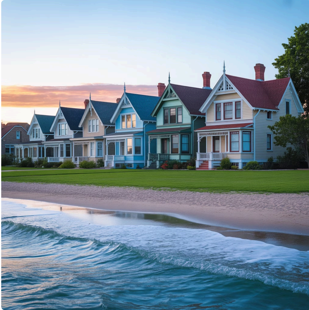
Historic lakeside homes with character and charm