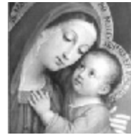
January 1 Mary, Mother of God