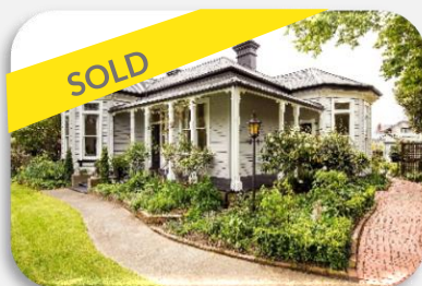
79 Walker Street