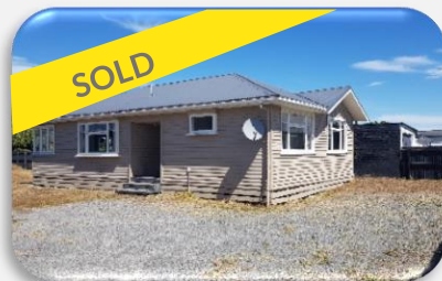
19a Anne Street