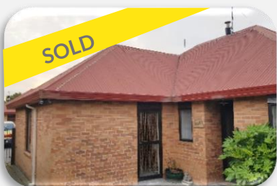
3/91 Chalmers Avenue