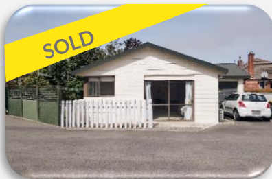
317 Havelock Street