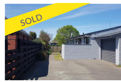
128 Alford Forest Road