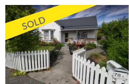
78a Peter Street

I pride myself on selling homes within the appraised ranges that I give to my clients, it is my aim that there is no big surprises or disappointment to my vendors and that there is a happy result for the vendor and buyer in the transaction of buying and selling their home. When buying a home, I will search out properties on our database that meet your requirements.