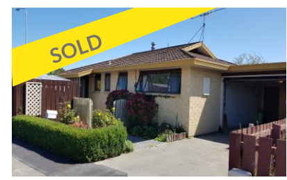
119 William Street