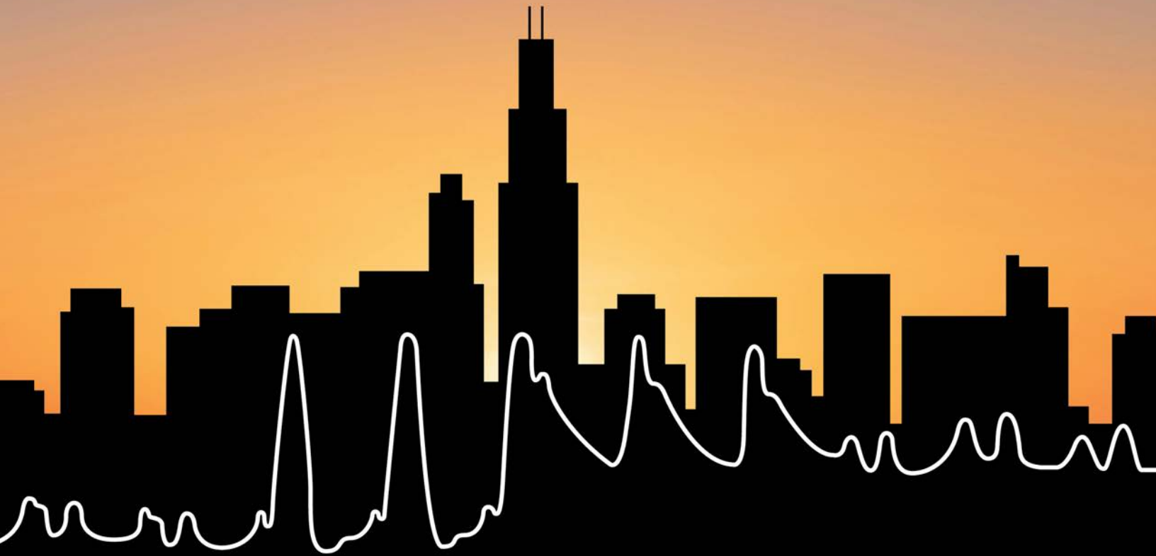
Exhibit Prospectus & Sponsorship Opportunities

NOVEMBER 14, 2025 • DAVID RUBENSTEIN FORUM • CHICAGO, ILLINOIS