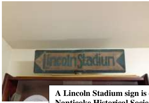
A Lincoln Stadium sign is displayed at the Nanticoke Historical Society Offices.