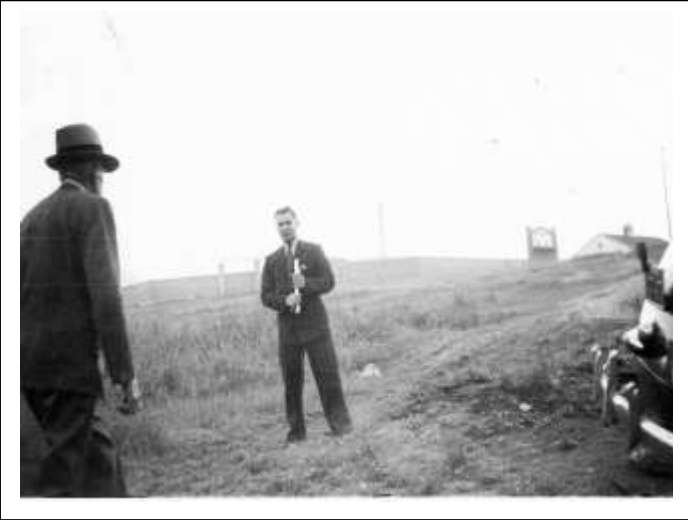
In 1946, Col John D. Bulkeley, Congressional of Honor Medal recipient spoke during an event at the Lincoln Stadium. The stadium scoreboard can be seen in the upper right

his actions in the Pacific Theater during World War II. In addition to high school games, the new stadium hosted yearly firework displays, community events, band concerts and Golden Glove tryouts, playground pageants and of course the high school graduations.