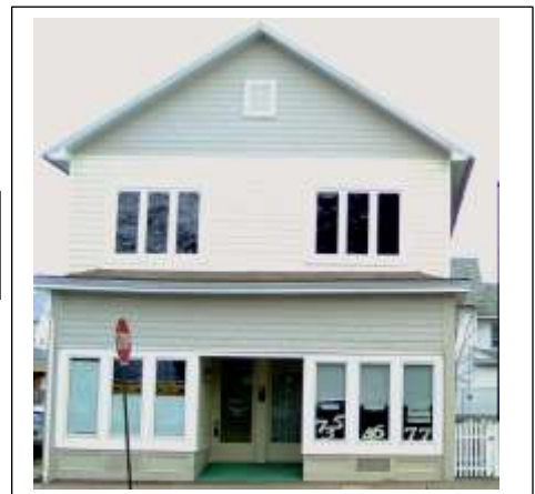
The property as it appears today