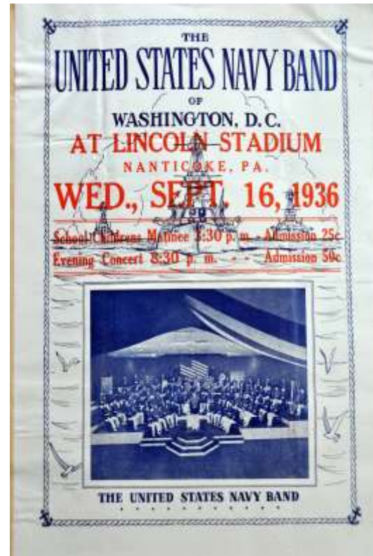
The admission charge for the evening concert was double the matinee price for the United States Navy Band performance at Lincoln Stadium in 1936.

Some residents remember climbing over the walls of the stadium to play baseball or football, perhaps imagining thousands of fans cheering them on. Or maybe they just wanted to hang out with friends. One society member remembered being in the stadium when Hurricane Diane hit the region in 1955. He and his buddies found shelter in a dugout-type structure in the stadium until they could safely make their way home.