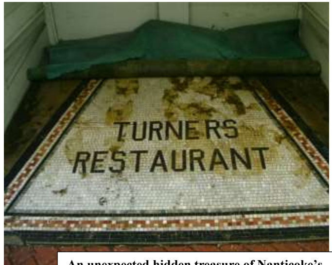
An unexpected hidden treasure of Nanticoke's past is uncovered. A mosaic sign greeted the customers of Turner's Restaurant in 1921.

In 1911, William Turner renovated a building at 18 E. Broad Street (in the vicinity of the Bus Stop Café). The location was previously the Kosker Restaurant. After renovations Turner's business was described as a lunch room, fruit stand and cigar store and later Turner's Oyster House. In 1921, Turner moved to the 201 Prospect and Broad Street location creating his unique restaurant. In a Wilkes-Barre Record article, the restaurant was described as such, "The room is beautifully (done) in a special blue-colored chestnut wood with other wall finishes to harmonize. The furniture and fixtures are all of the same finish as the wainscoting. The room is divided into two parts by a movable partition, a soda fountain on one side and a dining room on the other. Nanticoke, for the first time, can boast of a thoroughly modern and attractive restaurant."