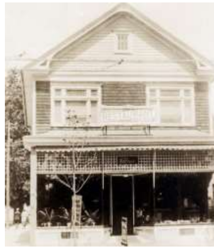
An undated photo of Turner's Restaurant on the corner of Prospect and Broad Street.