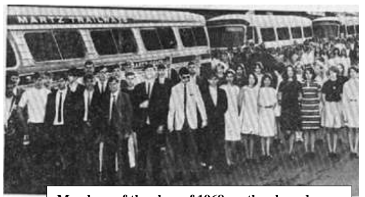
Members of the class of 1968, as they board buses taking them on their senior trip to Washington D.C. These students were the last to have their graduation ceremony in Lincoln Stadium.