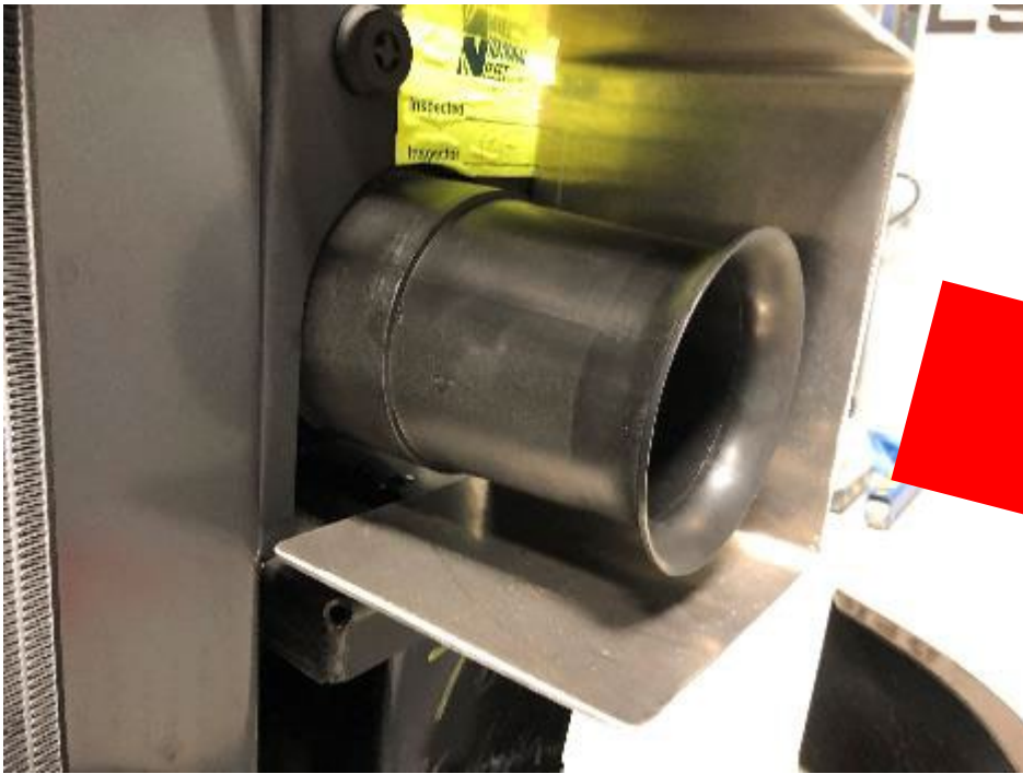
Plastic nose installed