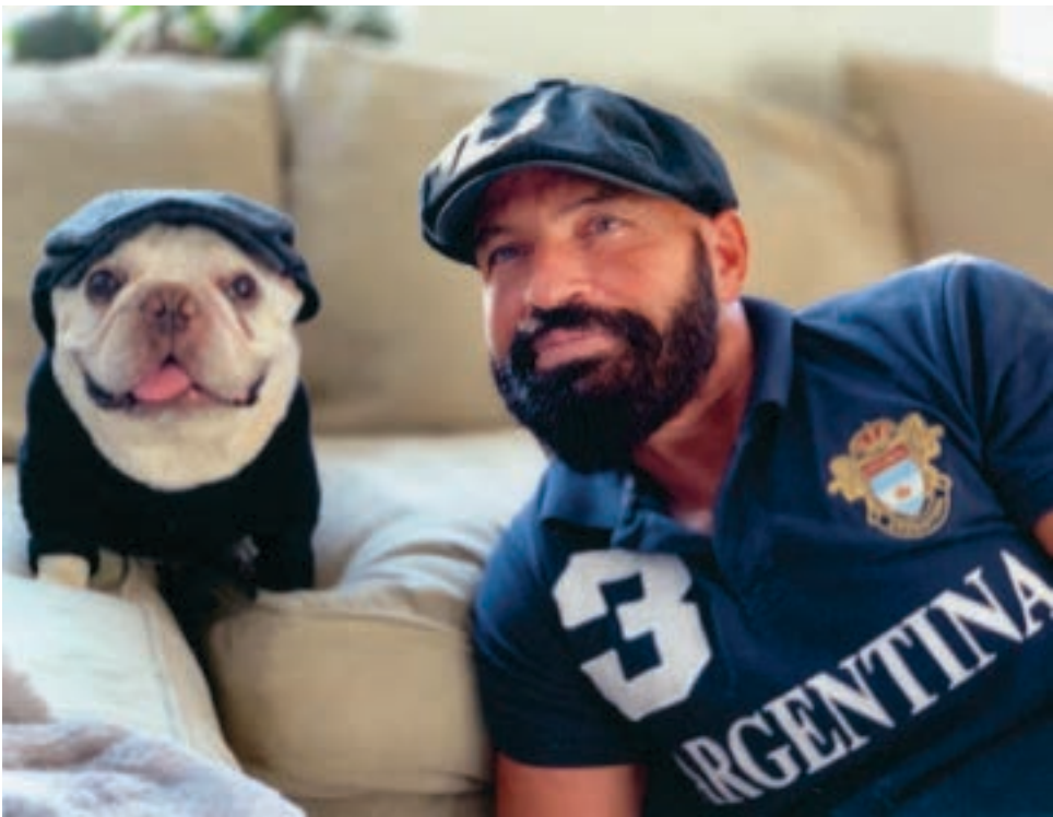
The French Bulldog with the Soulful Eyes