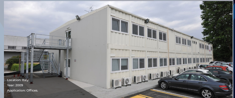
Location: Italy Year: 2009 Application: Offices.