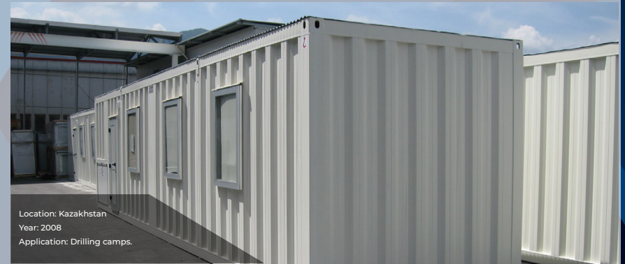
Location: Kazakhstan Year: 2008 Application: Drilling camps.

Relocatable living camps for O&G and mining projects, multi-story constructions, heavy-duty applications.