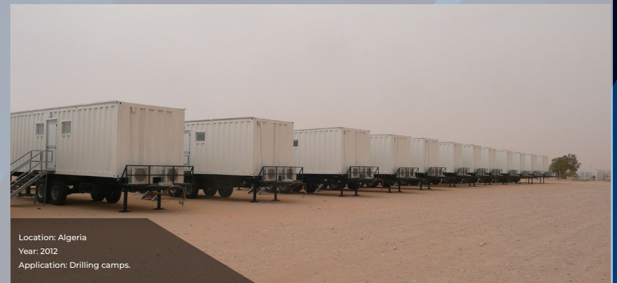
Location: Algeria Year: 2012 Application: Drilling camps.