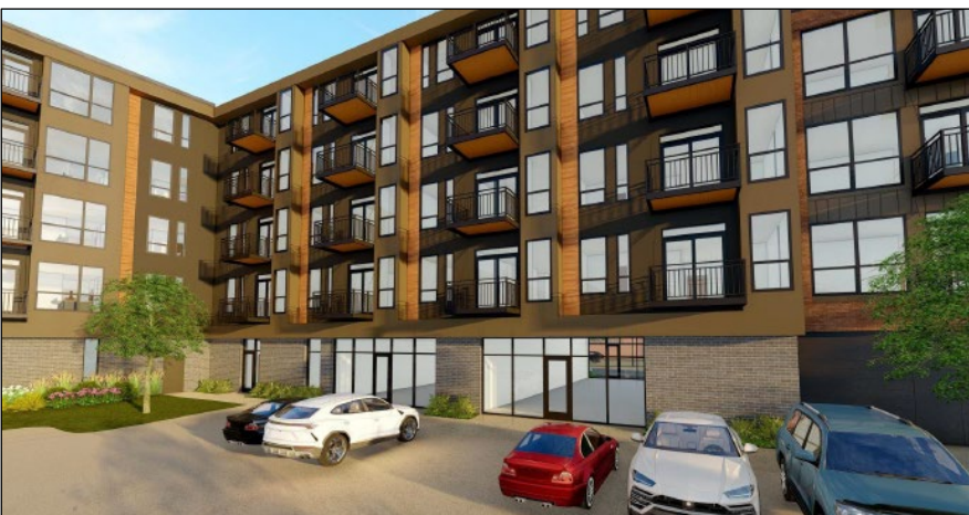
Retail Entry from Parking Lot