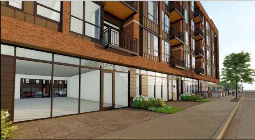
North Avenue Looking West

7501 West North Avenue Wauwatosa, Wisconsin