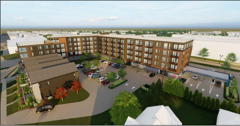
Aerial Looking Northwest

7501 West North Avenue Wauwatosa, Wisconsin