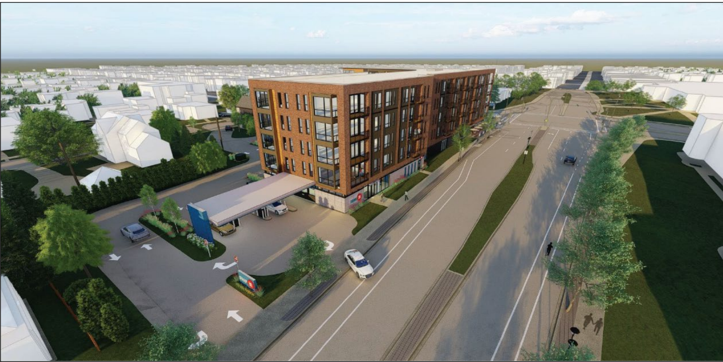
Aerial Looking West on North Avenue