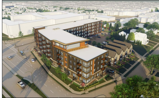
Aerial Looking Northeast