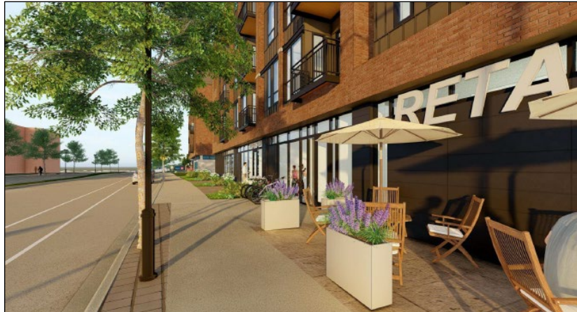
North Avenue Looking East