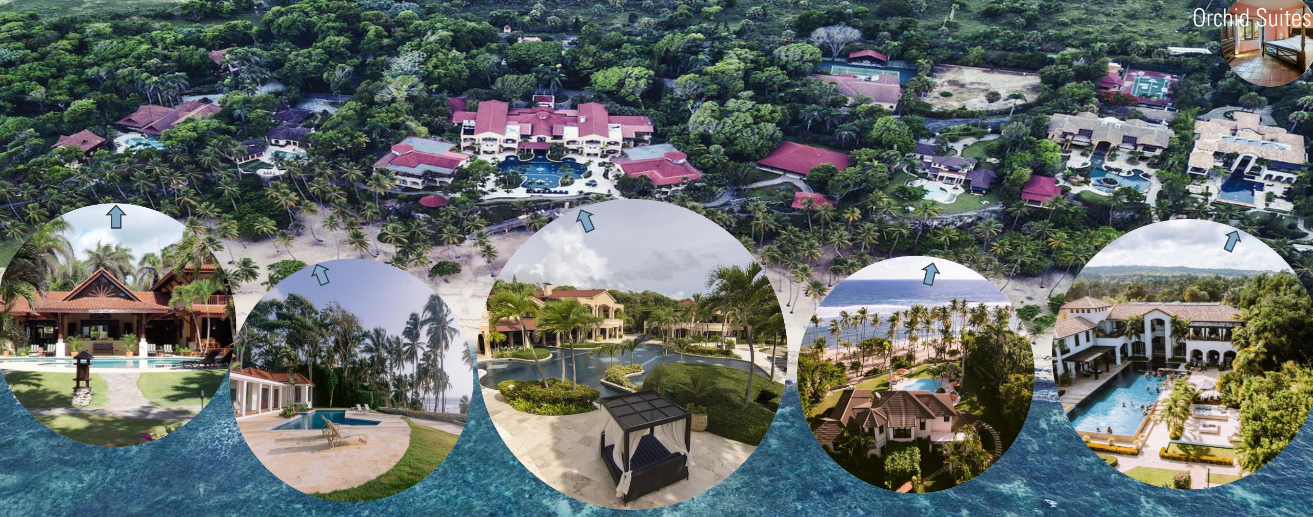
Sunrise Villa 8 bedroom