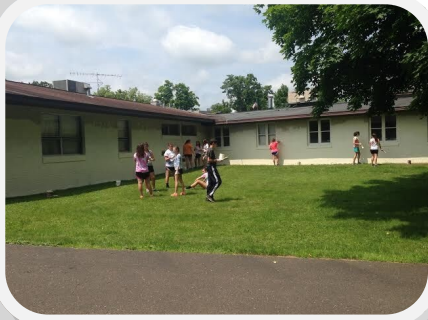
Herzl Group helping paint the Home and Away Ministries in Luck. (above)