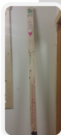
Frederic Lioness Club Stud, from Stud Fundraiser. (above)