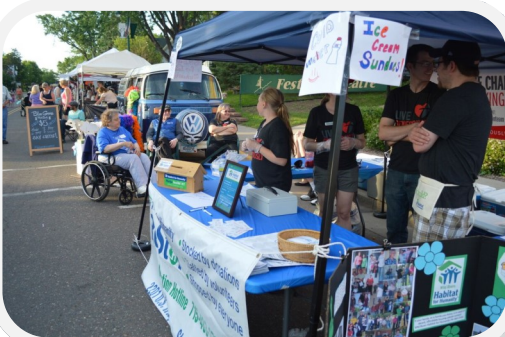
Ice Cream Social Fundraiser Booth. (above)