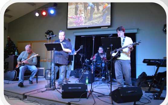
Praise Band performing at the Holiday Concert Fundraiser. (above)