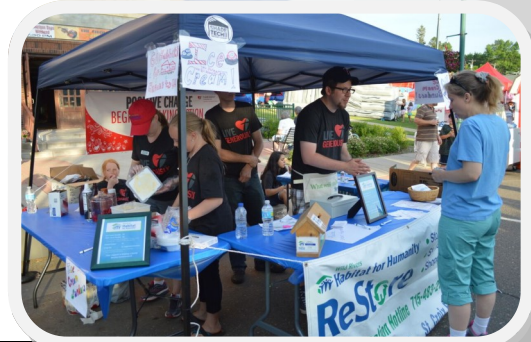
Ice Cream Social Fundraiser Booth (below)