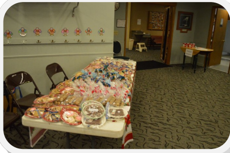
Baked goods for sale at the Holiday Concert Fundraiser. (above)