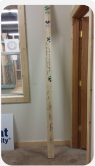
Amery Hospital and Clinic Stud, from the Stud Fundraiser. (above)