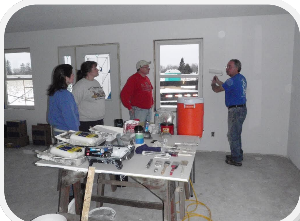
Trade Lake Mutual working on the Martin home. (below)