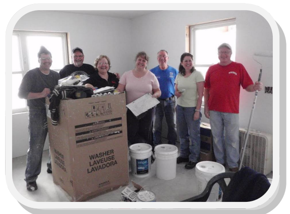
Trade Lake Mutual working on the Martin Home (above)