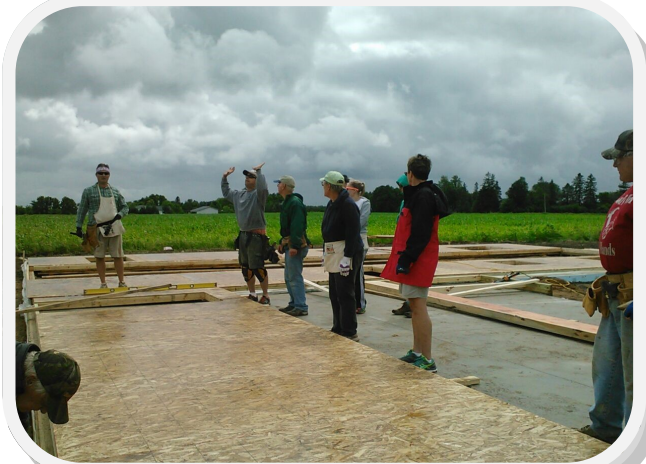
Mt. Zion Lutheran Church Group. (above)